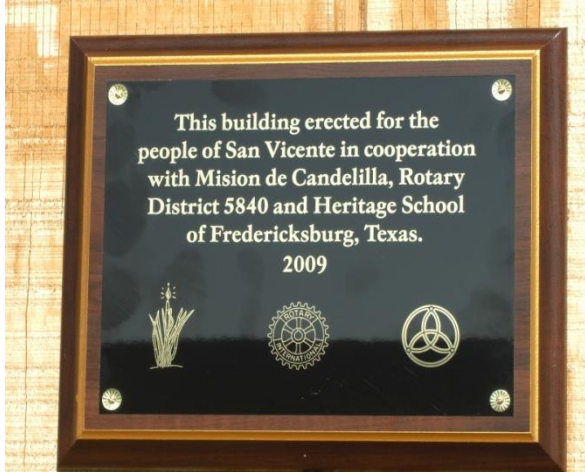
Rotary Hunger-plus funded it, Mision De Candelilla planned and facilitated it and Students and Parents of Heritage School of Fredericksburg, TX built it.