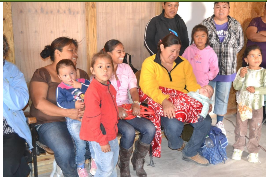
Folks waiting to see the doctor in San Vicente last March. The baby is getting all of the attention.

We are in need of another truck. We currently have a 1 ton 4x4 crew cab truck that has 261,000 hard miles on it. It continuously breaks down and not only costs a great deal for repairs but it is at times unavailable for use.