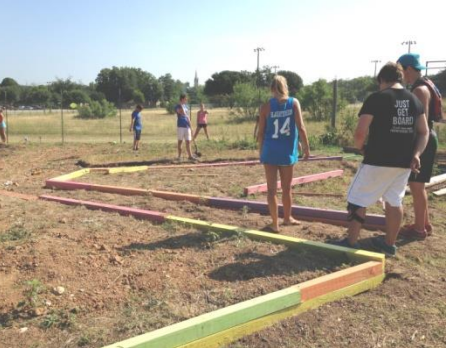
For the third year in a row we facilitated "Local Missions Week" with students from Heritage School. This year they painted, built fence and replaced railing around raised garden beds at our local Boys and Girls Club. In addition they facilitated vacation bible school in association with Primera Iglesia Bautista.