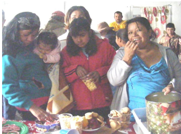
The people of San Vicente enjoy a Christmas party on December 16 2011. Fredericksburg United Methodist Church sponsored a trip to bring gifts for every person in the village. We handed out gifts (given by families of FUMC) and then celebrated with a feast. The feast was followed by a worship service. After the service, food packages were given to each family supplied by a generous friend from San Antonio, Texas.