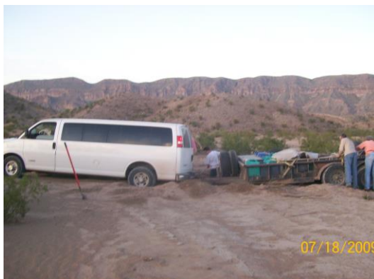
We have new vans but that does not stop us from getting stuck. Our four wheel drive truck was broke down early this summer. As a result we had to pull the trailer with our vans. It worked but not without a little extra work!