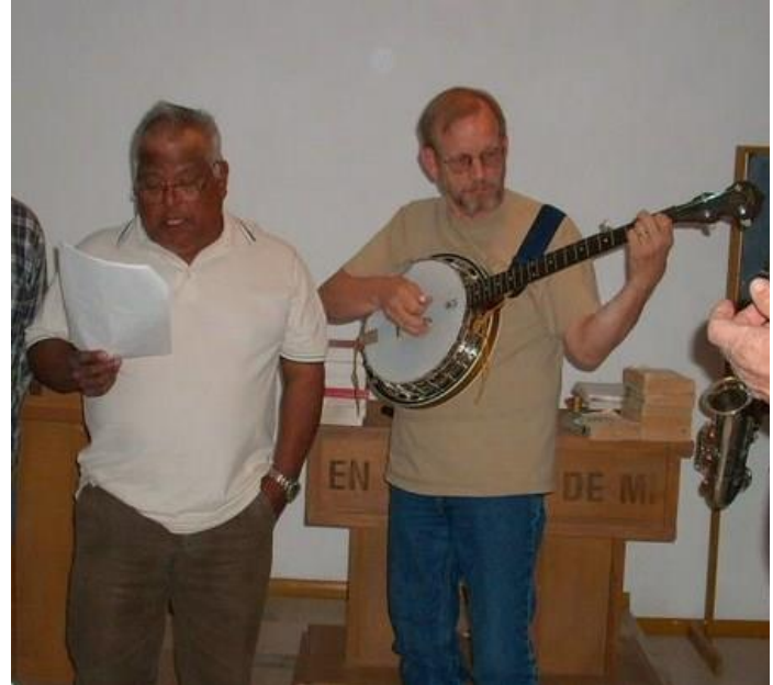
MDC has formed a new band that plays exclusively in Northern Mexico. Their name is Los Tigres Del Norte