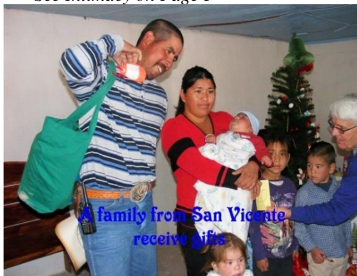
Look at the joy on the faces of this family. Each family received gifts given to them by a family from Fredericksburg United Methodist Church.

See Christmas Gifts for San Vicente on Page 2